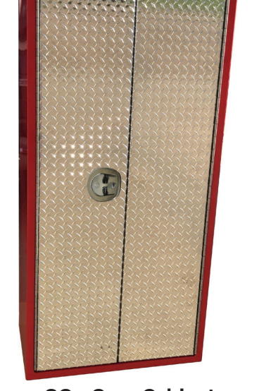
GC - Gear Cabinet

American Truckboxes, LLC is an innovative designer of storage products for the transportation and service industries manufacturing steel, stainless steel, and aluminum products.