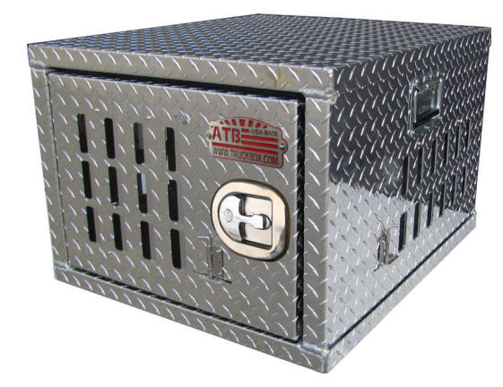
DK - Dog Kennel