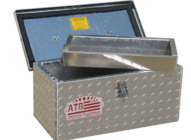
TO - Tote Box