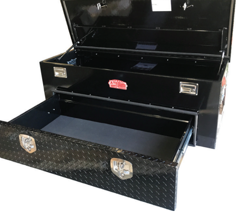
TCP - Top - Chest Box